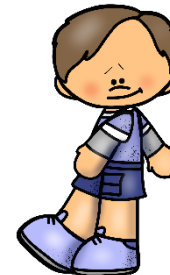
go for a walk