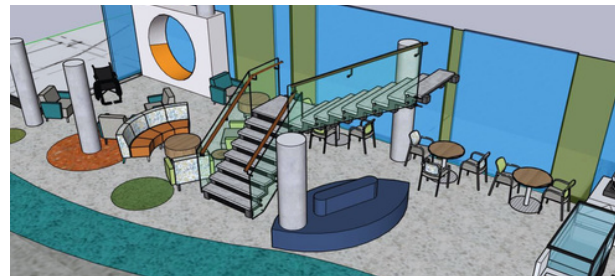
Atrium and Café

The interior design, inspired by nature, seamlessly integrates the outdoors with features such as a river-like floor design and tree-like columns. The theme of circles subtly emerges, with circular windows and flooring reflecting the nests, cocoons, and burrows that birds, insects, and animals call home—just as Grandview Kids feels like home to many.