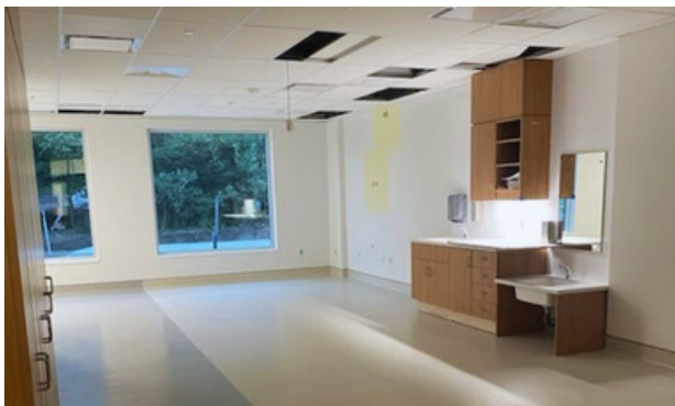
Grandview School classroom

As of August 2024, construction on the New Grandview Kids is progressing rapidly, with Level 1 over 85 per cent complete and one elevator operational. Levels 2, 3 and 4 are over 90 per cent complete, with all elevators expected to be fully operational by the end of August. The exterior of the building is structurally complete; the façade is over 90 per cent finished. The countdown is on for our Fall opening. Our construction partners and staff are busy preparing the site for occupancy in the coming months. Read more about Operational Readiness.