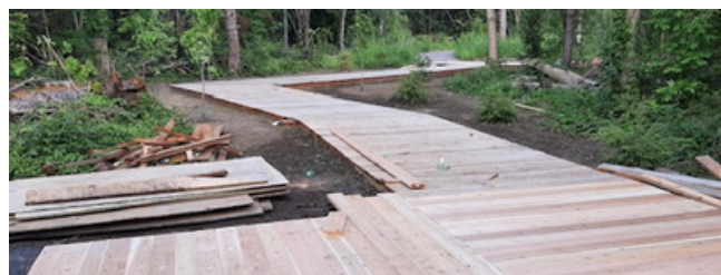
Outdoor Sensory Trail

Our outdoor, fully accessible trail is 90 per cent complete, with wood and asphalt pathways recently completed. Additional trees and bushes will soon be planted to bring the trail to full completion.