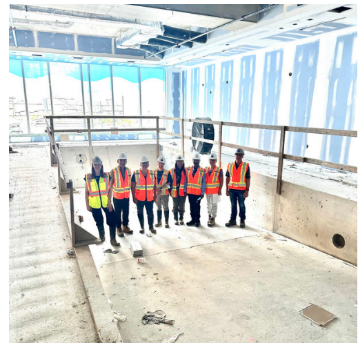
Members Grandview's leadership team in the pool