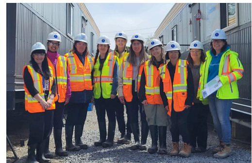
Staff touring the new site

Our new headquarters is more than just a building; it's a realization of a vision that will continue to benefit clients and the community for years to come.