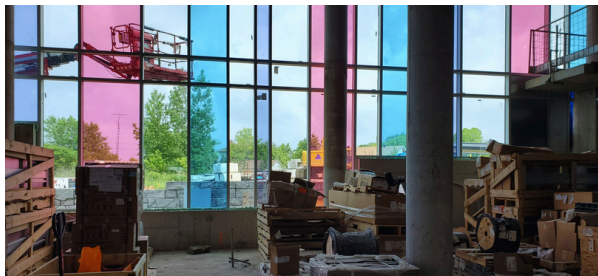
Glass wall in atrium

Upon entering The Jerry Coughlan Building — named in honour of a generous supporter whose legacy gift helped fund the facility — you are greeted by a striking atrium. This central hub is more than just a waiting area; it's a lively meeting space featuring a café and custom art installation. The Family Resource Centre, within the atrium, provides essential resources and support to caregivers, including a branch of the Ajax Public Library.