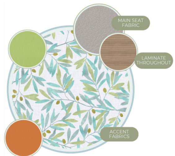
Level 2 material swatches

This work includes using space planning software to determine which models will best fit into the areas; the software also helps visualize the most appealing combinations of finish colours. After multiple detailed reviews of these elements, furniture orders will be placed. It has taken hours of detailed review to make sure the New Grandview Kids' furniture and finishes are aligned with our branding, safety, Infection Prevention and Control (IPAC) and interior design standards.