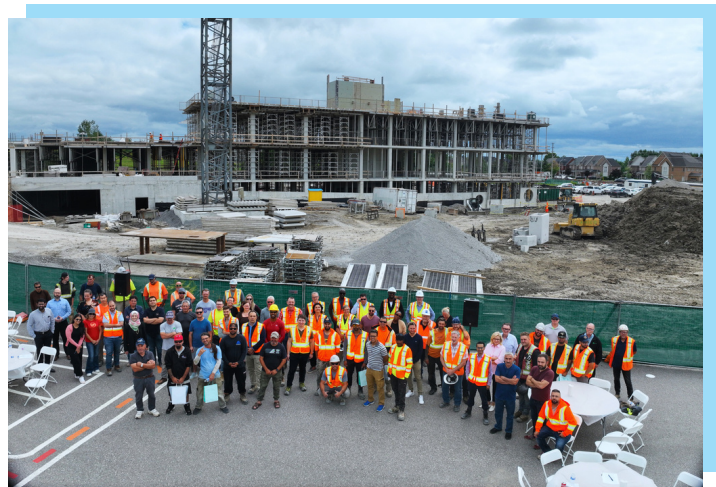
Safety Stand-down attendees

At the event, Children First Consortium shared their vision, "To create a construction industry where safety is ingrained in every aspect of the work we do by reducing incidents and saving lives." The emphasis on maintaining strict safety protocols for the New Grandview Kids is evidenced by the fact that zero injuries resulting in modified duties/work have occurred.