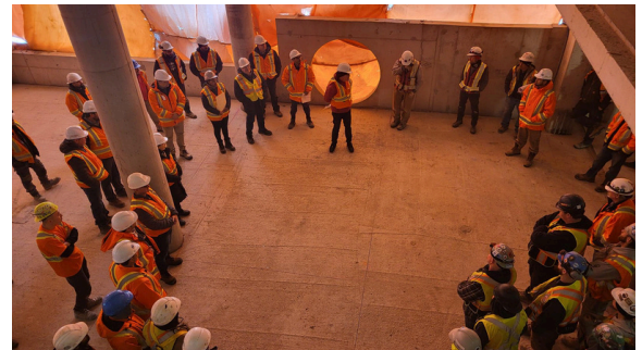
Worker Appreciation Event for CFC staff.