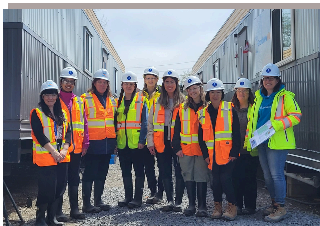
Photo of Grandview Kids Therapy Working Group touring the construction site.

If you are a Grandview Kids client, and this transition impacts your care, you will be notified by Grandview Kids over the summer months. Satellites will be maintained in Oshawa (Dwyer), Port Perry, Bowmanville and Whitby (Abilities Centre) to ensure care is accessible close to home for Grandview families across Durham Region.